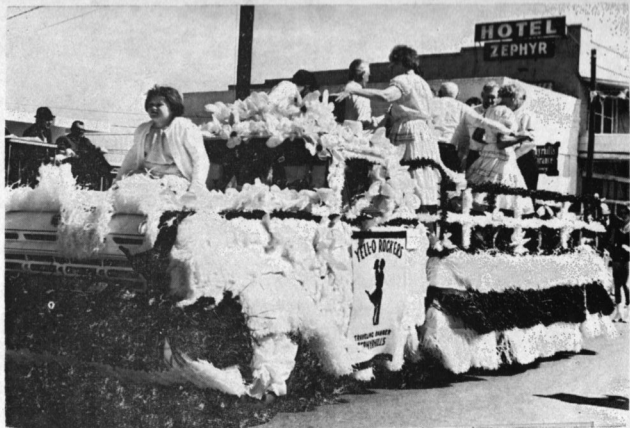
The Prize Winning Entry of the Zephyrhills Yell-O-Rockers, in Zephyrhills' Founders Day Parade. (See Story)