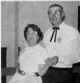
R/D Instructor of the Month: