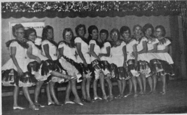
The Ladies of the Star Promenaders, Miami, show off their new Club dresses. (See Story)

as being a good Caller and is welcomed into the family of Callers at the Ox-Bow.