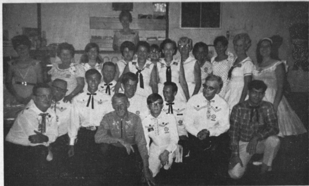
These Visiting Nautical Wheelers of Key West 'dood' it again! (See Story)