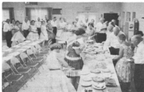
The Summer Squares of Punta Gorda ending their summer session with a "CARRY IN" at the Harbour Heights Civic Association Building.