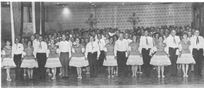
GRAND MARCH FINALE AT THE RECENT FOUNTAINBLEAU EXTRAVAGANZA. 62 SQUARES ATTENDED THE AFFAIR.