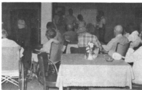
THE ALLEMANDERS S/D CLUB of Satellite Beach, at an exhibition dance for the Patients at Carnegie Gardens Nursing Home in Melbourne.