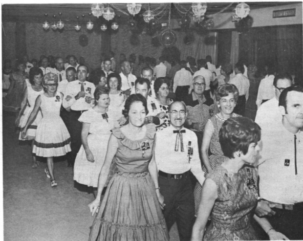
SOME THREE HUNDRED AND FIFTY SQUARE DANCERS FROM FLORIDA AND GEORGIA IN GRAND MARCH at the recent Eighth Annual Beachcombers Week-end, sponsored by the Daytona Beachcomber Square Dance Club.