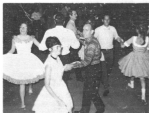
DANCERS, Jekyll Island Jamboree, Jekyll Island, Georgia.

We are hoping you will bring the family to this one. (Rates: $12.00 double, $10.00 single).