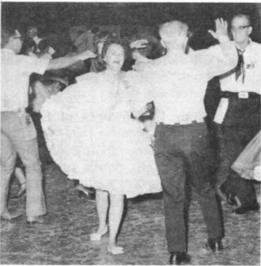
Fun at the Convention! The group shown here are members of the Nautical Wheelers Square Dance Club of Key West.