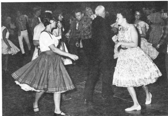
Pictured above are members of the Nautical Wheelers of Key West dancing at the recent Florida State Square Dance Convention.

NEW DEADLINE FOR ALL MATERIAL AND ADS EFFECTIVE OCTOBER 1 WILL BE THE 5th OF THE MONTH