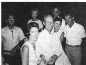
Proof positive that Square Dancers have more fun! This photo was taken at the new Sarasota Agriculture Building built by the County Fair Assn. See story on Page 5.

NEW DEADLINE FOR ALL MATERIAL AND ADS EFFECTIVE OCTOBER 1 WILL BE 5th of MONTH