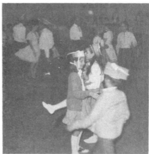
Some of the group graduating from the class.