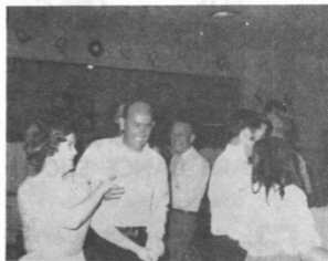
Swingin' Squares, Valentine Dance, Valdosta, Ga.