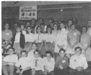
Knotheads visiting from Jacksonville, Fla. This was the entire group that was making Knotheads.

to Europe to visit their grandson who is in the Armed Forces. They hope to visit a few Round Dance clubs while over there this summer.