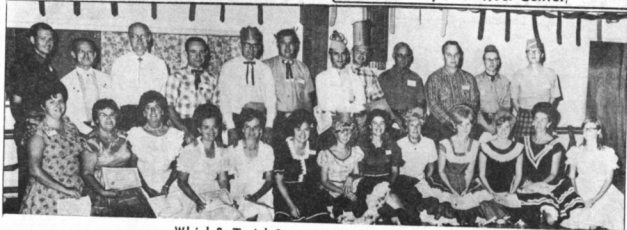
Whirl & Twirl Summer Graduating Class