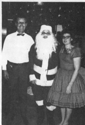
Swingin' Squares Christmas Party, Valdosta, Georgia.