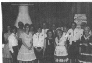
East Coast Dancers Representatives at 13th Annual New Year's Eve Ball, Eau Gallie Civic Center, Eau Gallie, Florida. The Mayor's representative for the City Recreation Department is in the center of the picture.