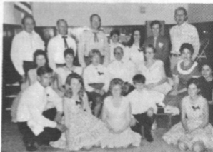
Part of the 1970 Sun Squares graduating class from Deerfield Beach.