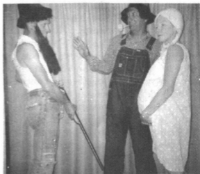
There's gonna be a weddin'!