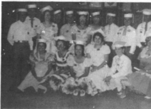
New 1970 club members of The Merry Twirlers.