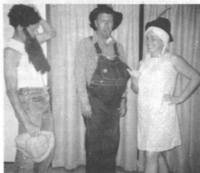
Never trust a woman!!!