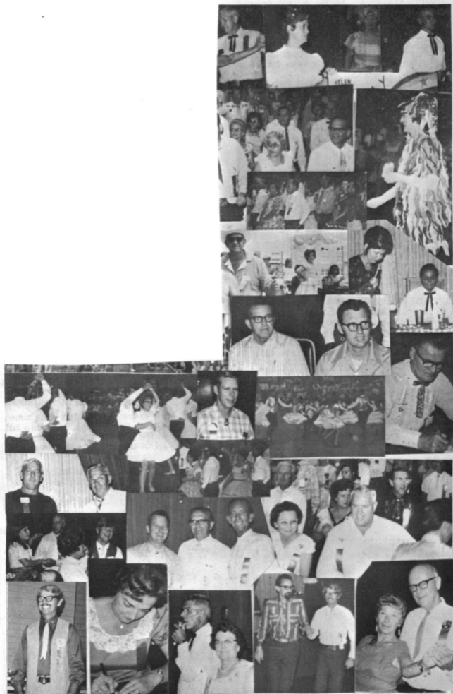
STATE CONVENTION JACKSONVILLE 1971