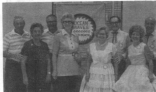
Miami Beach Ocean Waves New Officers