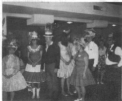
Easter Parade Contestants Modernaires