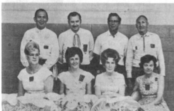
Officers of Twirl-A-Ways