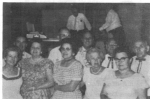
Smoothie Club Receive Knothead Badges