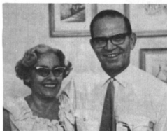
Chairman, Fla. Federation of Sq. Dancers

Let's declare a moratorium! Let's stop having memory courses, is it necessary to combine six or seven basics into one call? Unfortunately too many of the new so-called directional calls combining a number of basics are too active for the caller to call and the dancer respond. Let's give the caller and dancer time to work out varied sequences and routines with the calls we have now without having to devote time and effort learning and teaching some new Bucket of Worms.