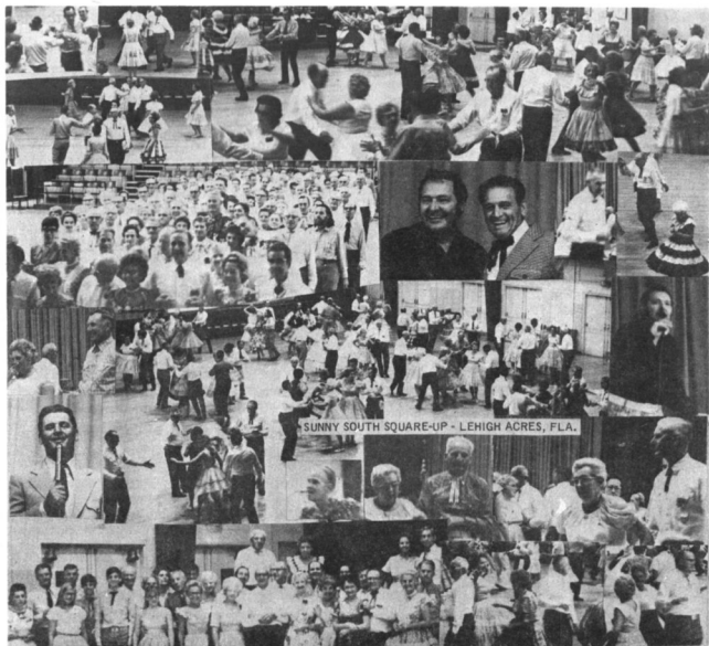
SUNNY SOUTH SQUARE-UP - LEHIGH ACRES, FLA.

REGISTER EARLY FOR THE STATE CONVENTION - SAVE MONEY WRITE: P.O.BOX 11675, TAMPA, FLA. 33610