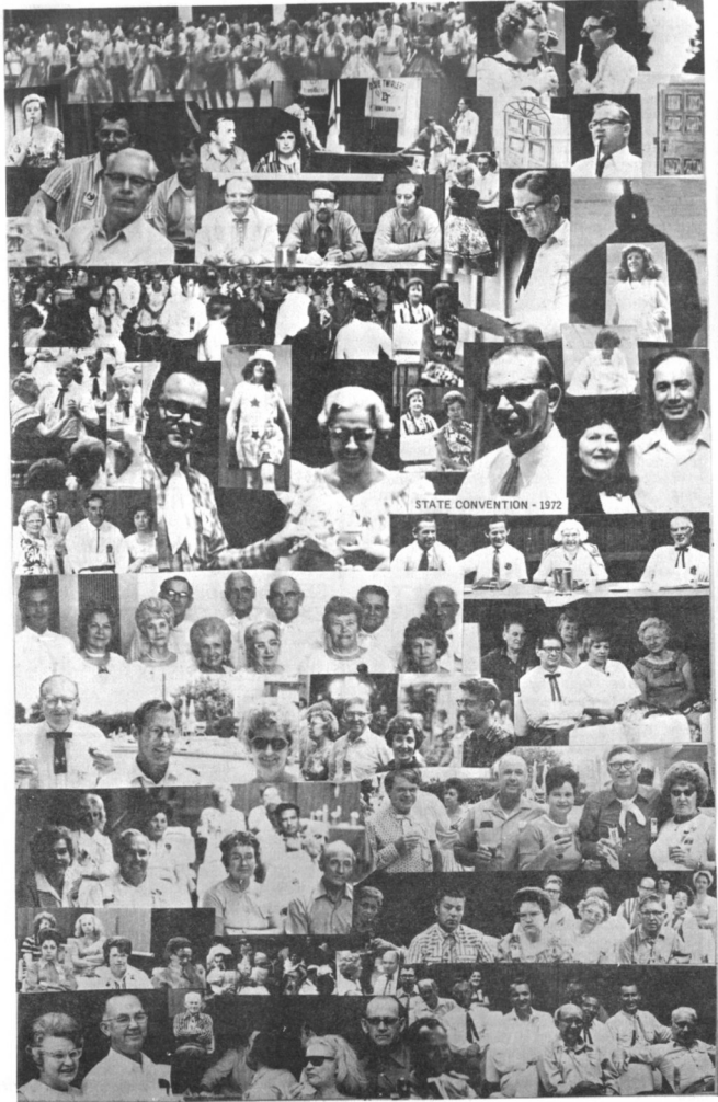
STATE CONVENTION - 1972