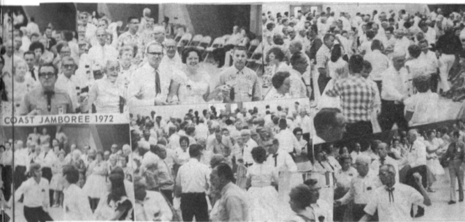
COAST JAMBOREE 1972