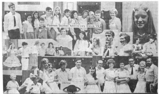
Phantom Squares Anniversary Dance '72