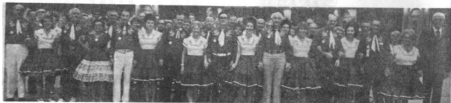
Miami Beach Ocean Waves 10th Annual Extravaganza at the Playboy Plaza - Start of the Grand March. At the far right is Mayor of Miami Beach, Chuck Hall. Over 500 Florida square dancers attended the gala.

Help Bow & Swing by advertising your special dances