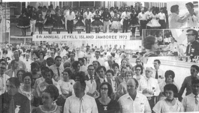
8th ANNUAL JEYKLL ISLAND JAMBOREE 1972