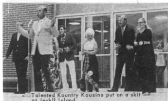
Talented Kountry Kousins put on a skit at Jekyll Island