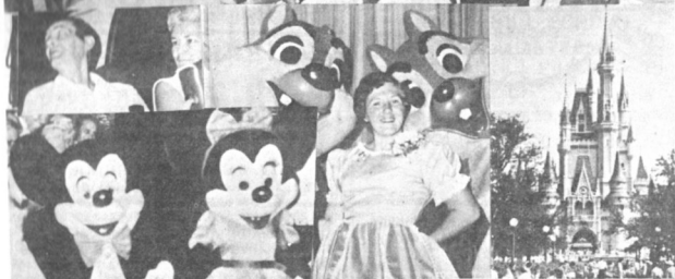
WONDERFUL WORLD OF SQUARE DANCING AT DISNEYLAND