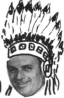
Chief Black Cloud