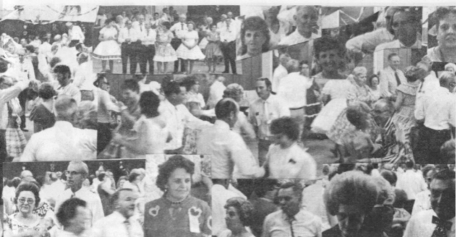
1968-69 Homecoming & More Inauguration