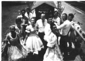
Covered Bridge Squares and their Prize winning float in Coral Springs May 5th.