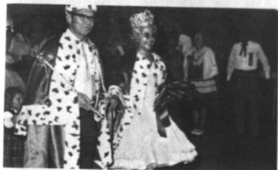
A "Real Sweetheart" Couple from Gainesville at the Sweetheart Ball in Eau Gallie. He is past President of the Dancers Federation.