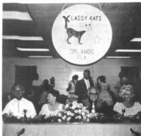
Special Dinner for the Bookmillers given by Klassy Kats in Orlando