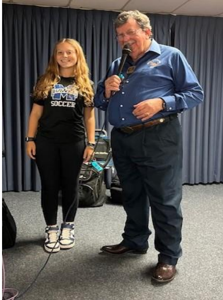
We have a lot of Red, White and Blue to honor our Veterans this month!