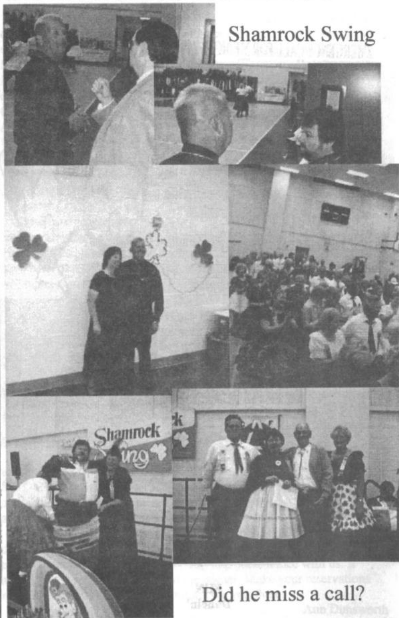
Did he miss a call?