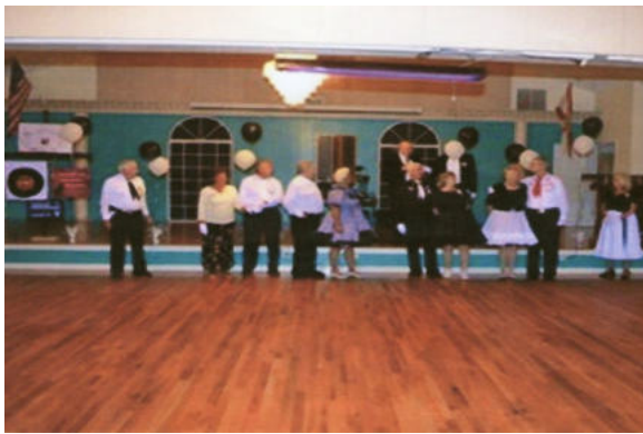
Other club Presidents at President's Ball Feb 21