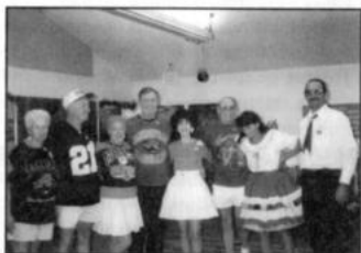
Cheerleaders and Spectators