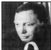
the serious one,