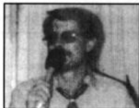
the singing one.