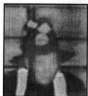
the hatted one and