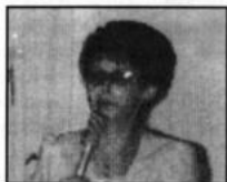
The pretty one,

Oh well, here's four not so recent pictures of CFA callers. And we all know how good they can perform. Guess who they are?