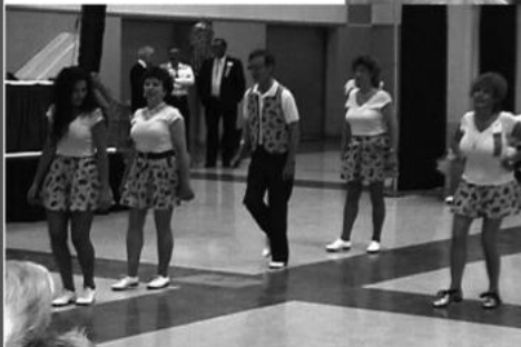
They worked hard and did a great job too.