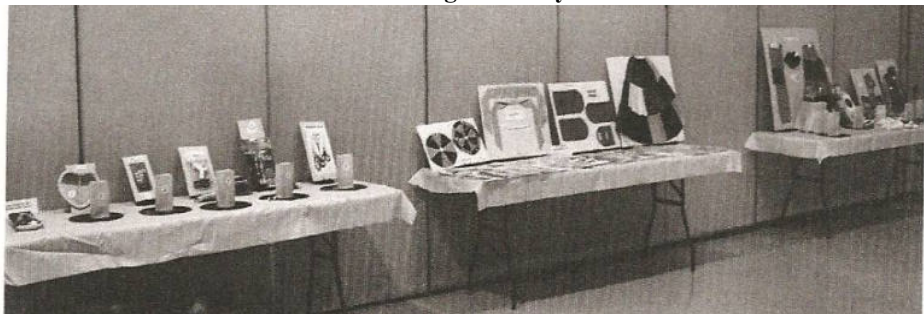
Pictured above is an array of some of the door prizes and “how to” displays.