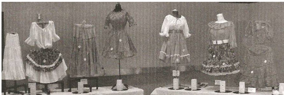
Above—Some of the outfits given away. All items were donated.

We heard so many nice comments about Sew and Save, so we thought you would like to see a couple of photos of the room.