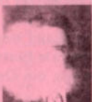
Art Springer SQUARES