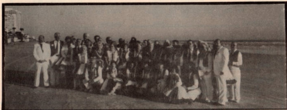
As we serenaded the sunrise with "Oh, What A Beautiful Morning" Film later on CBS's Good Morning America Show