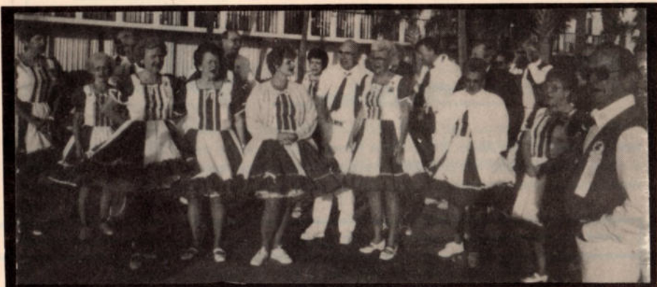
A group of CFA'ers gather at Daytona Beach to greet the morn