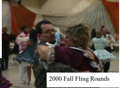
2000 Fall Fling Rounds