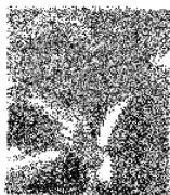
Ed & Phyllis Chase N. Ft. Myers, FL

November 14 & 15, 2003 Lakeland Center Lakeland, Florida