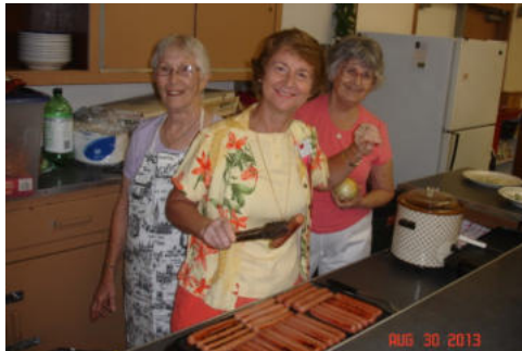
The Dixie Hot Dogs???