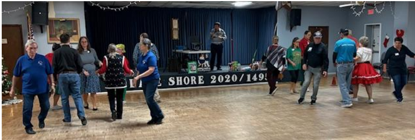
Most of the night we fielded two squares...though we probably had enough dancers for three