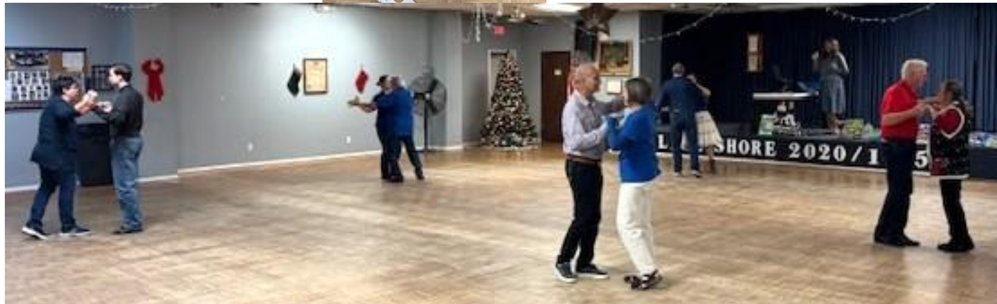
Five couples Round Dancing...but wouldn't it be lovely to have a dozen couples on the floor at once?