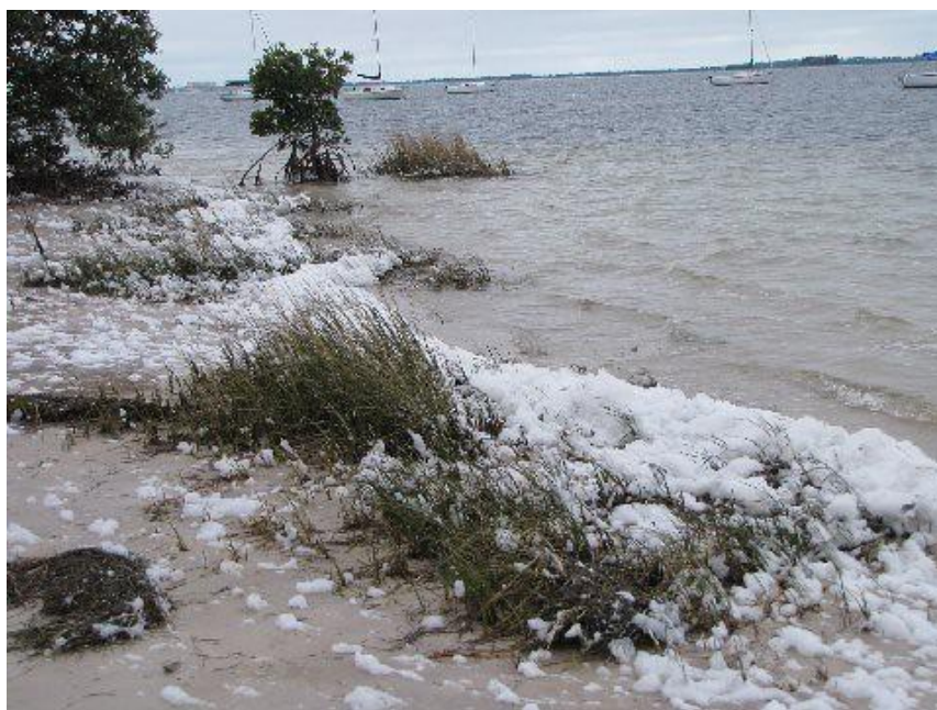
Winter in Florida