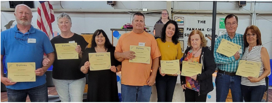
Swinging Squares Graduation students