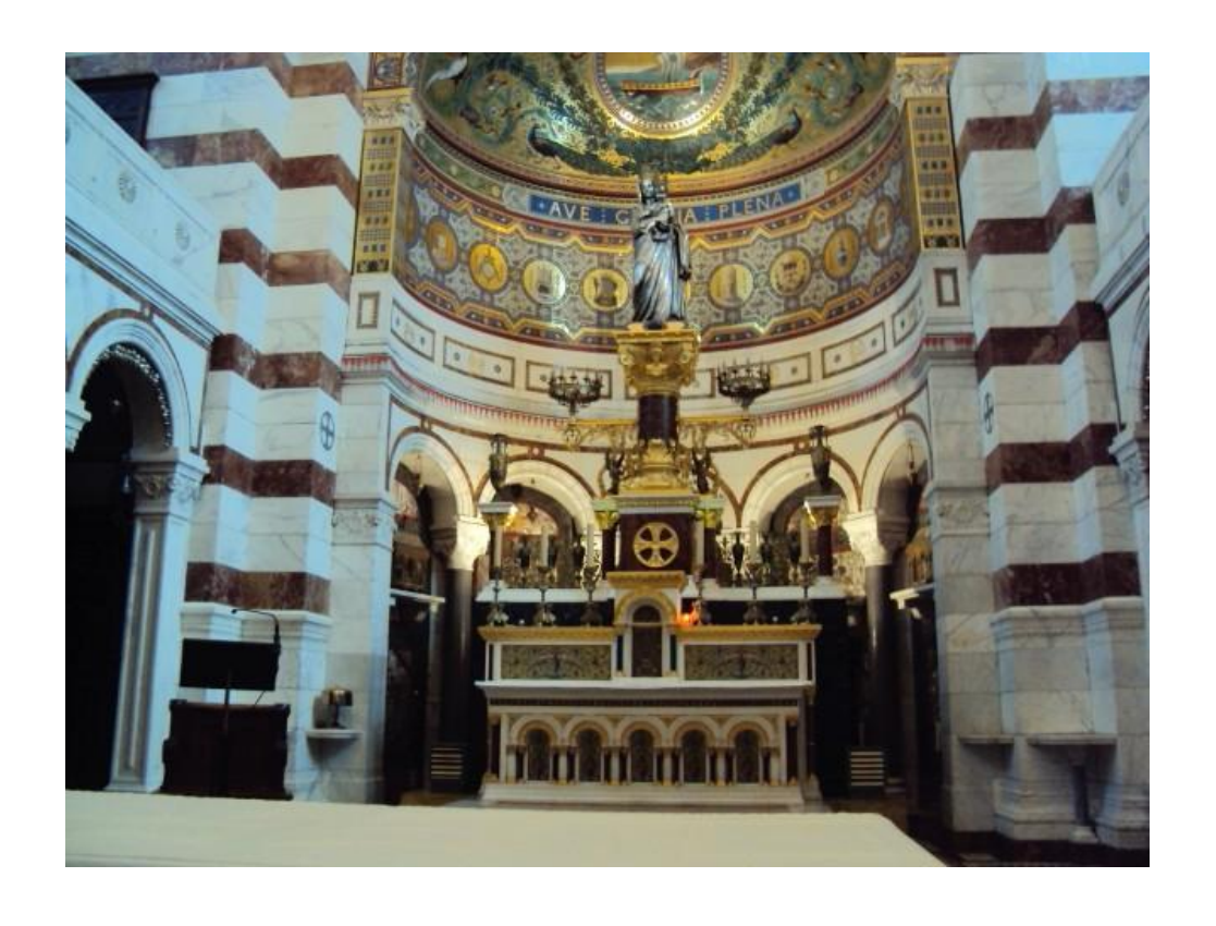
Saturday April 12