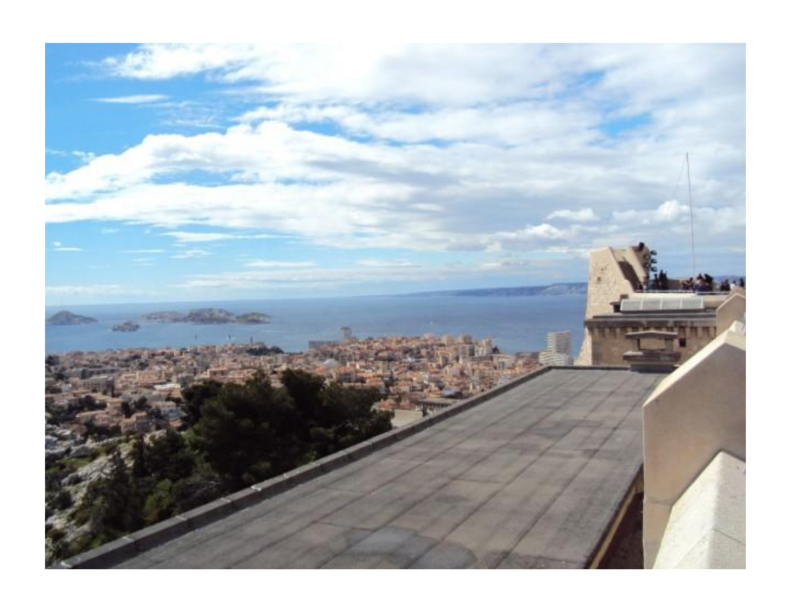
Sunday April 13