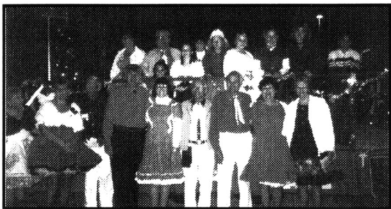
THE BARN FLOAT at the Christmas Parade.

The float was all decked out in Christmas lights with its own Christmas tree. Dale and Beth Young furnished the lights and the overall coordination of the float decorations was done by Roz Mestre. We thank all the dancers who worked on the float. A special thanks go to the Silver Squares for their support. It was a cool night and we needed all the dancers we could get. The dance was for over 2 hours - non-stop.