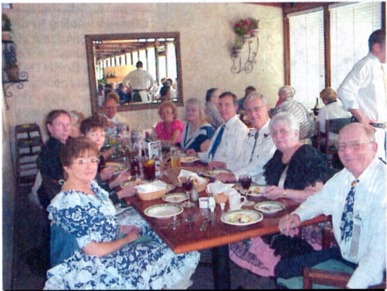
The BARN DANCERS in Lakeland for the SUNSHINE FESTIVAL. Our group really had a great time. If you want to join us on one of our many FUN trips, just let us know. We are planning on a GRAND trip to Alaska in August of 2002.