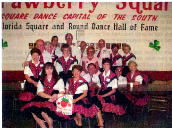
The BARN DANCERS with the Strawberry's Squares banner that they made especially for us as we raided them in March. Nice group!