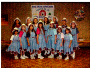
THE BARN'S YOUTH CLUB