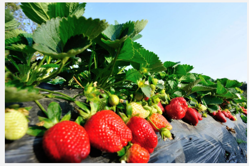
Strawberry Travelers 2019 Camping Schedule