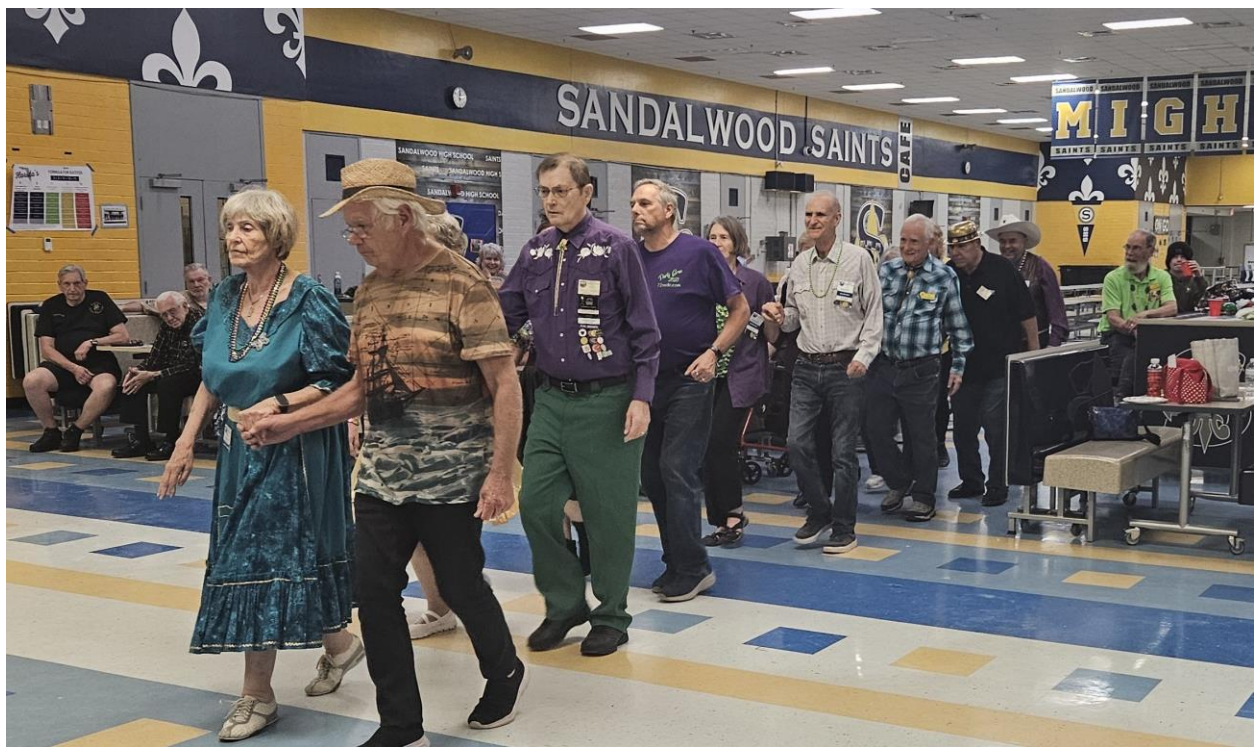
Moose Promanders Retrieving their Banner