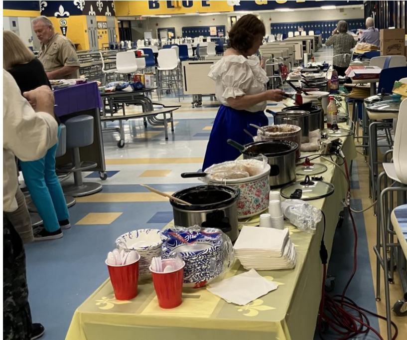
16 bowls of chili to choose from.