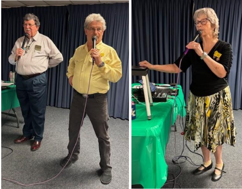
More of the march 20 th Dance