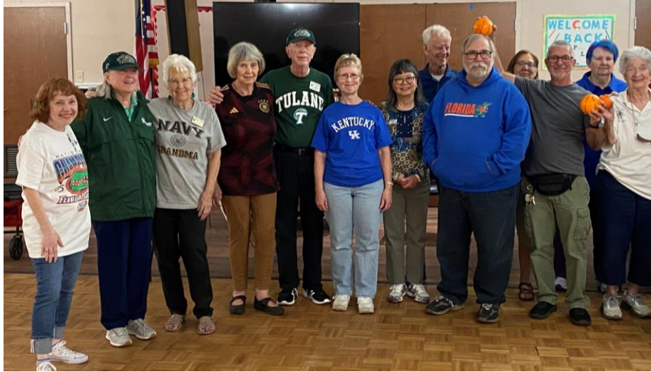
The whole group demonstrated Seabreeze Spirit!