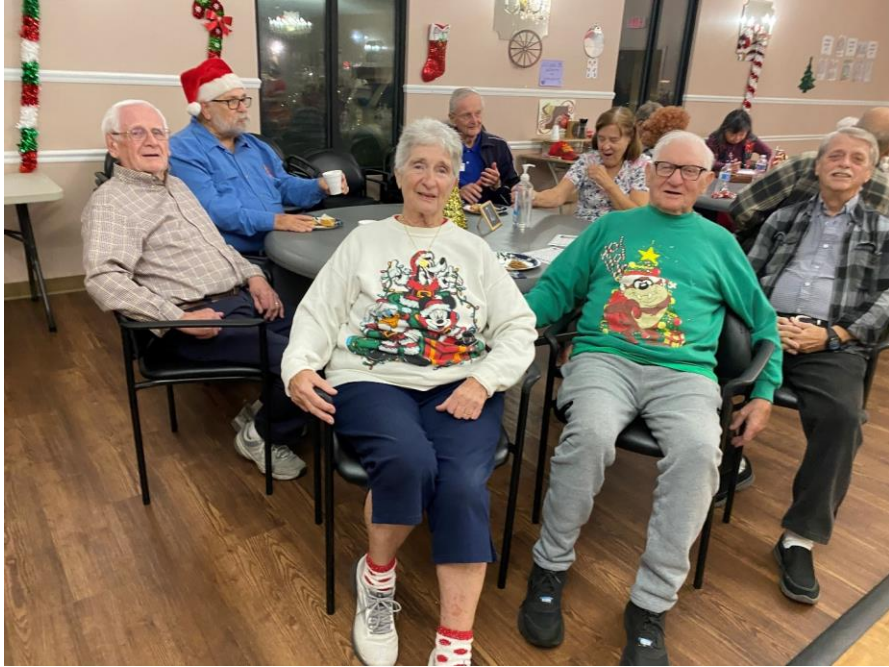
Celebrating Our Dear Caller