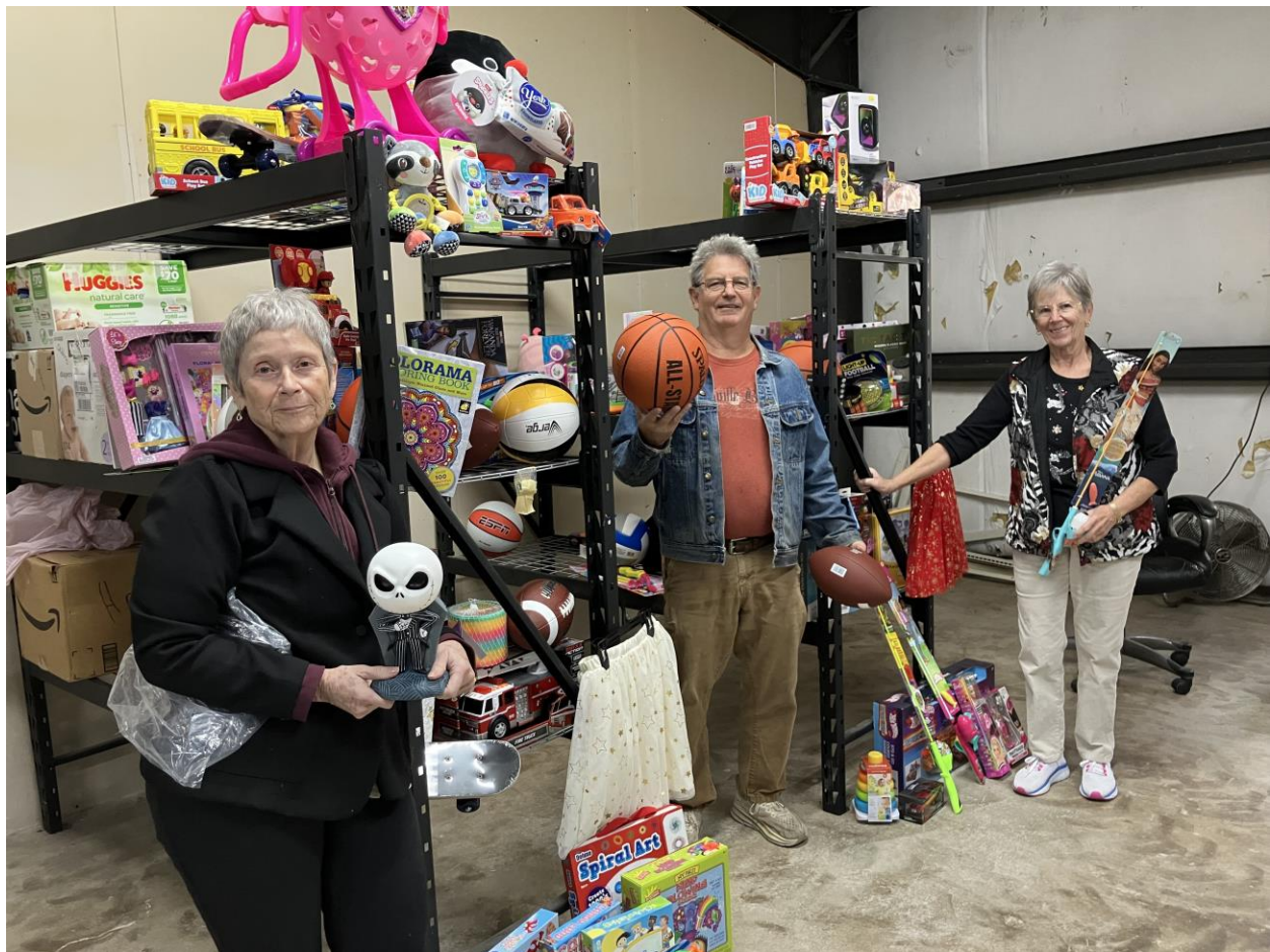
The Donations to the Kay Walker Toy Drive