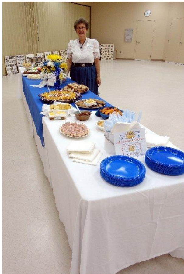
And of course they had their famous spread of refreshments!