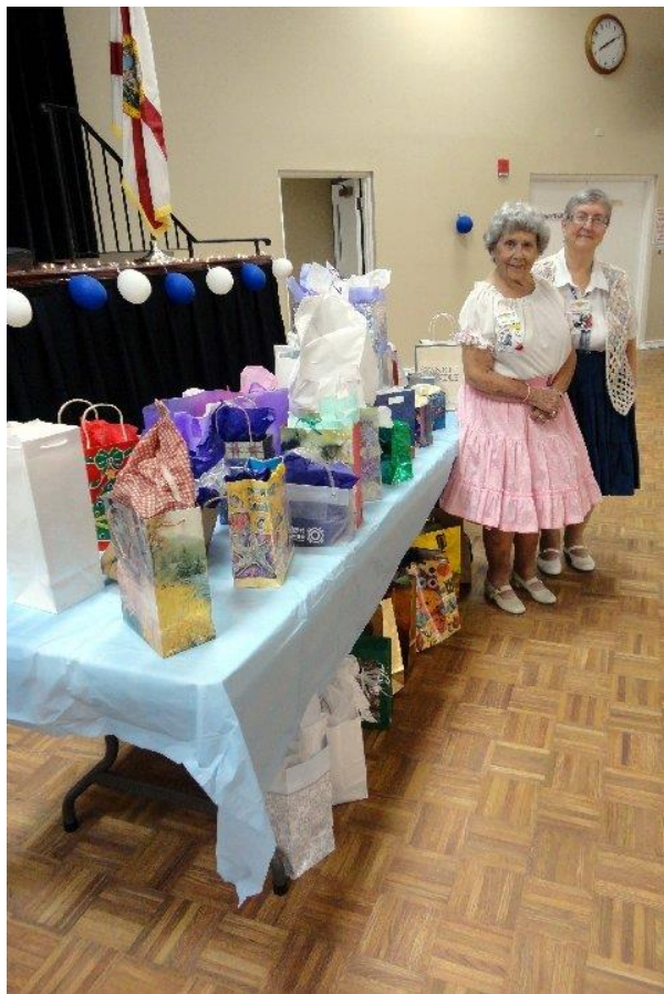
There were lots of door prizes which were donated by members and other Sun City clubs.